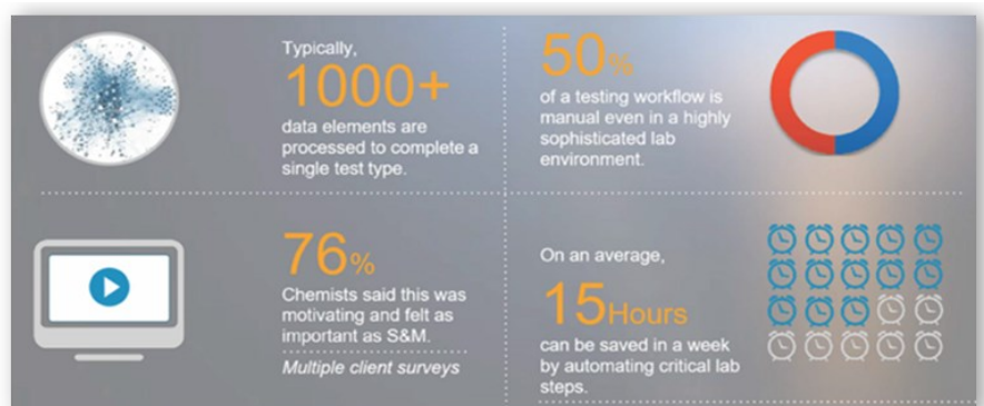
Figure 1. Labwise XD for Life Science Labs home page provides easy access to key tasks, processes, and documents.