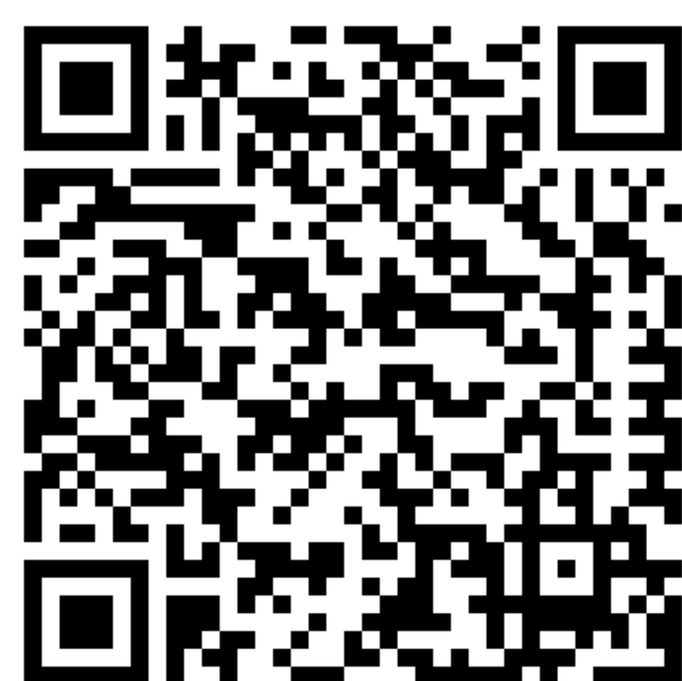
Figure 2: QR Code to access the Nonclinical Script Assessment Project PhUSE Wiki page